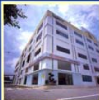
SIN MING TOYOTA SERVICE CENTRE